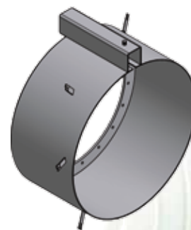
flange for installation in concrete tank

The text and technical data given may not be reproduced partly or completely without permission from Landia A/S. We reserve the right to make technical alterations. AL00B.C15-150611