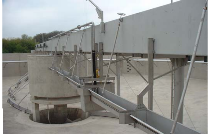
Floor scrapers with electric shield