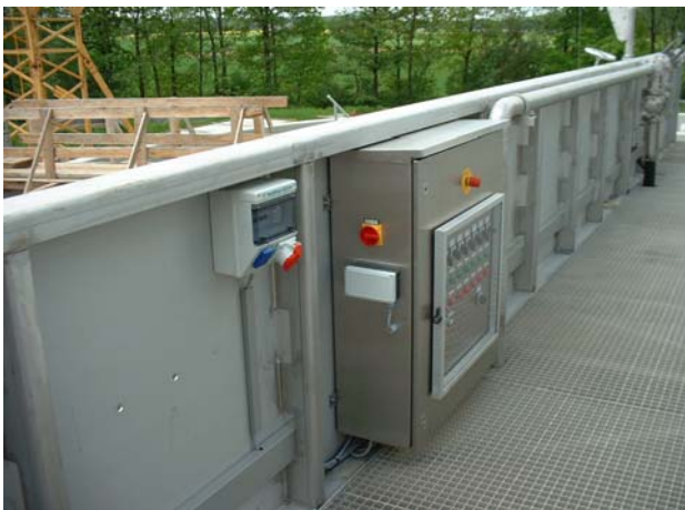
Control panel made of stainless